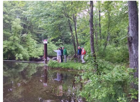
Above: Pine Tree Camp staff and Tree Farm Committee members review one of the potential tour stops.

Reminder: Switching to an electronic version will help us save on printing and postage costs, and stretch our limited budget even further. You can access the online version and subscribe today at: www.maintreefarm.org/newsletter.html